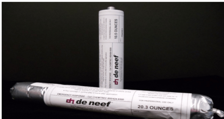
Figure 1. Swellseal WA Cartridge and Sausage