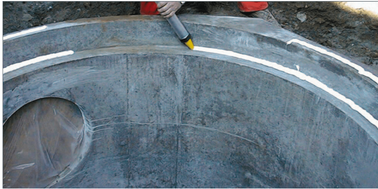
Figure 3. Swellseal WA in precast