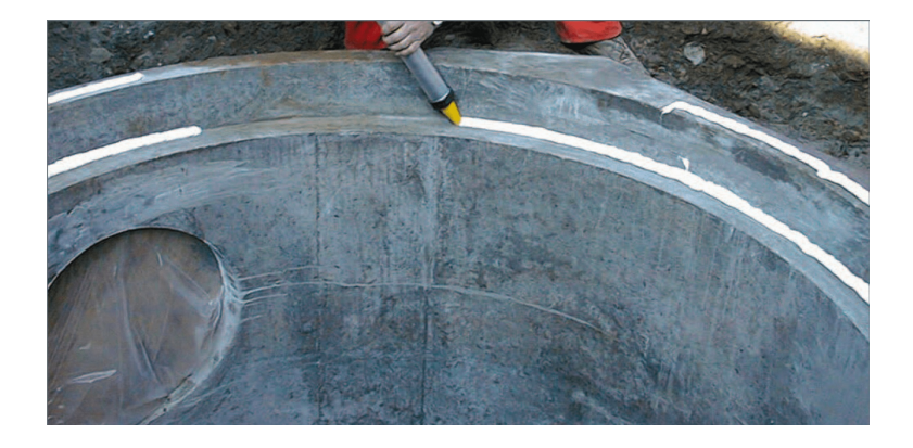
Figure 3. Swellseal WA in precast