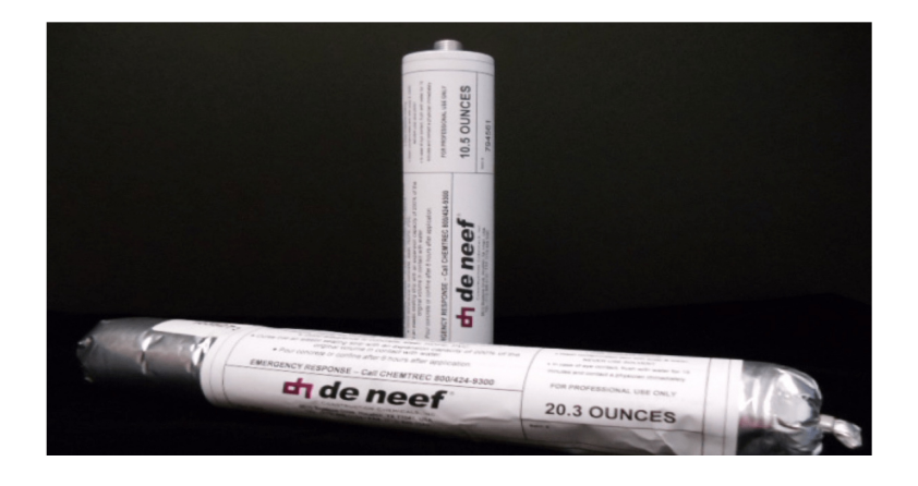
Figure 1. Swellseal WA Cartridge and Sausage